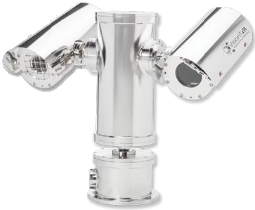
FireTIR system with double infrared camera