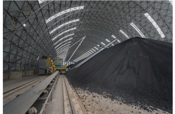
Coal storage warehouse

FireTIR Software offers full remote control of all infrared cameras, different inspection zones configuration, recording functions and analysis of measured data.