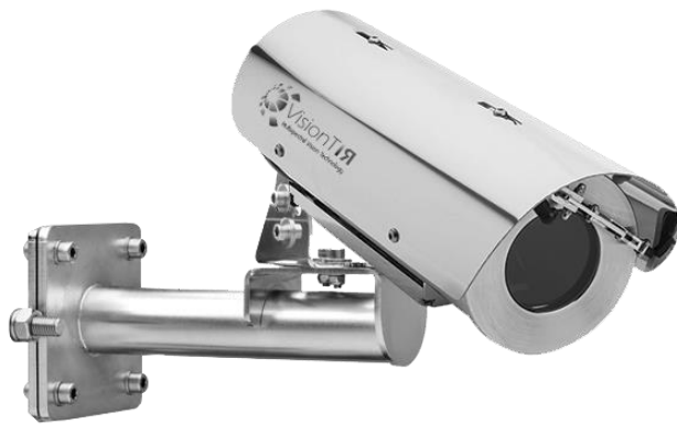
FireTIR infrared camera